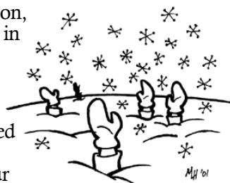
OK, Show of hands... Who's tired of snow?

Because of this shortfall, the Parish Trustees recommended to the Finance/Administration Committee that a special donation envelop for extra contributions to help defray our snowplowing expenses be placed in the pews. Donations of any amount are much appreciated. Please use the special envelope provided. Thank you for your support.