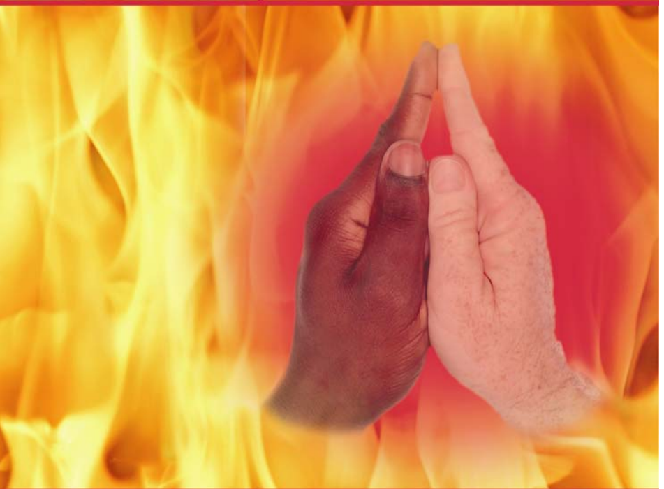
Cover design ©Liturgical Publications Inc. Excerpts from the Lectionary for Mass ©2001, 1998, 1970 CCD.

AND THEY WERE ALL FILLED WITH THE HOLY SPIRIT AND BEGAN TO SPEAK IN DIFFERENT TONGUES, AS THE SPIRIT ENABLED THEM TO PROCLAIM.