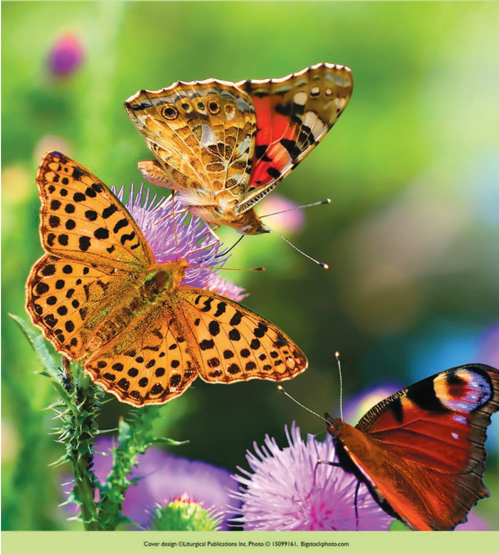
Cover design ©Liturgical Publications Inc.