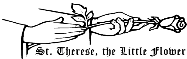
St. Therese, the Little Flower

The School Sisters of St. Francis will host a Pancake Breakfast/Fall Festival on Sunday, October 14th from 8:30AM to 2:30PM at St. Joseph Center, 1501 S Layton Blvd (27th and Greenfield). Mass will be held at 9AM in the historic St. Joseph Chapel. Cost for the breakfast is $7 per person; $4 for children ages 5–12; and free for children 4 and under. Snacks will be available for purchase in the afternoon until 2:00PM. Homemade bakery items, jams, gift baskets, holiday items, imports and arts & crafts will also be sold. All proceeds benefit ministry needs of the School Sisters of St. Francis. For information about the School Sisters of St. Francis, visit www.sssf.org .