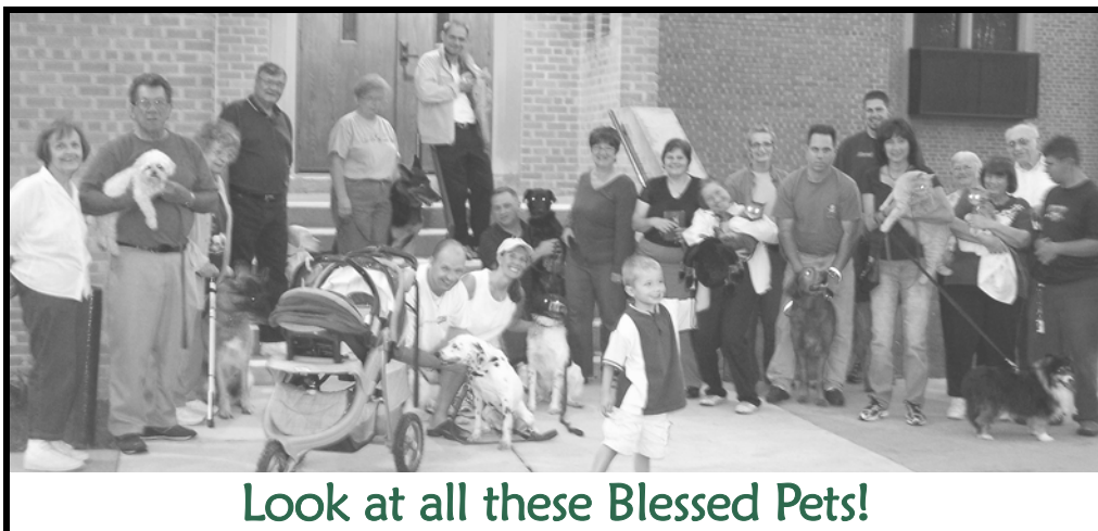
Look at all these Blessed Pets!