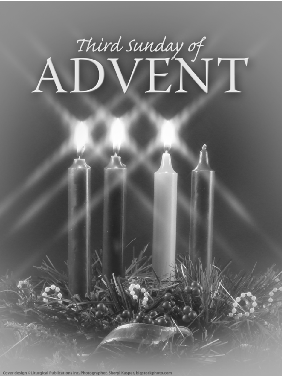
Cover design ©Liturgical Publications Inc.

Wednesday & Thursday: 8:00AM See inside for Holy Day Schedules