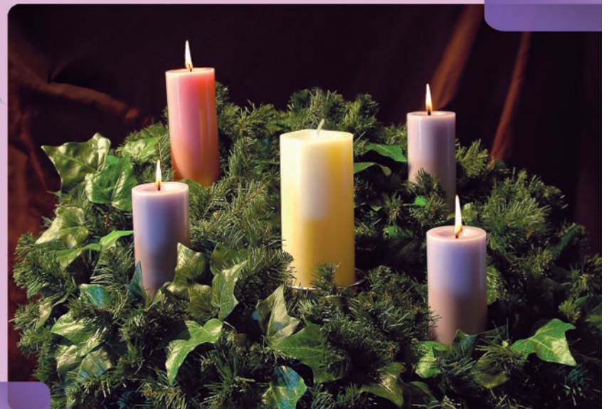
Cover design ©Liturgical Publications Inc.