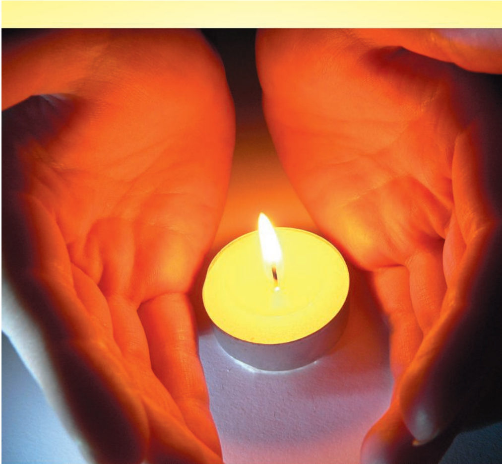
Cover design ©Liturgical Publications Inc. Excerpts from the Lectionary for Mass ©2001, 1998, 1970 CCD.