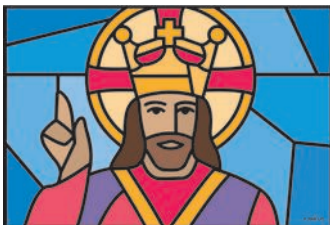
Our Lord, Jesus Christ the King