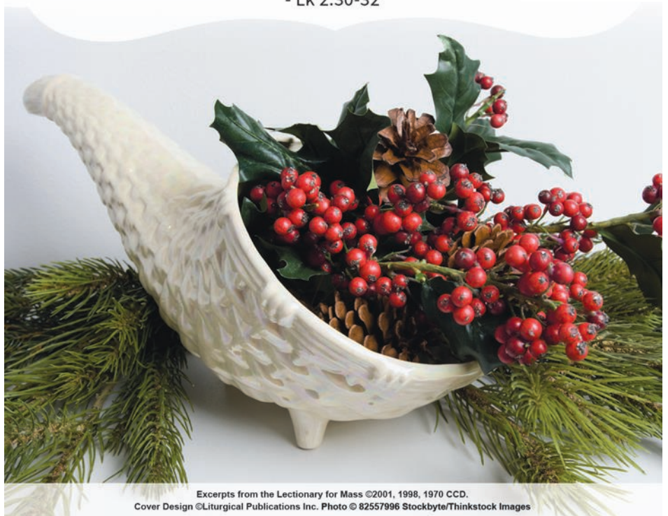
Excerpts from the Lectionary for Mass ©2001, 1998, 1970 CCD. Cover Design ©Liturgical Publications Inc.